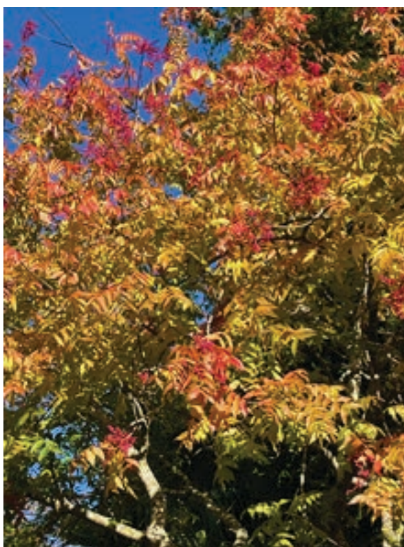
Pretty Pistache trees light up fall at local parks.

It was in the 1860s that America’s pioneer landscape architect brought calming, pastoral public areas to urban dwellers with