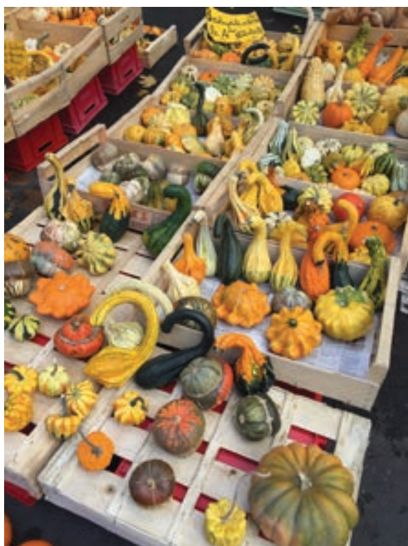
A glut of gaga gourds and petite pumpkins.